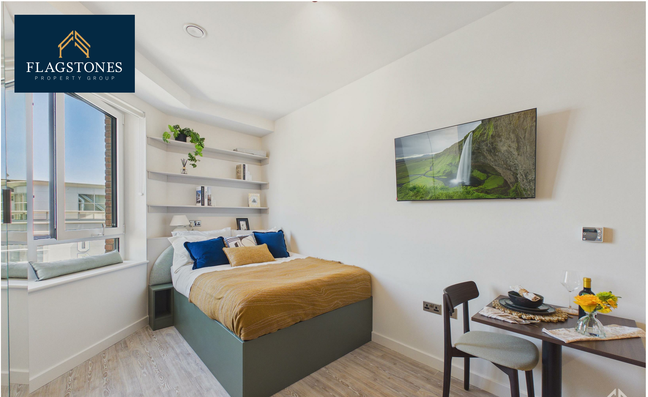
Room 123, The Rex Clarence Street, Kingston Upon Thames, KT1 1ST £1,400 Per month